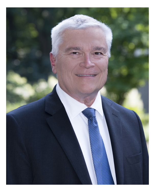
From the President