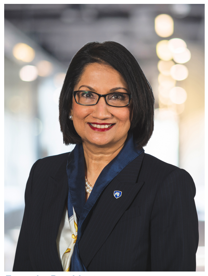
From the President Dear Penn State Community:

Penn State is dedicated to the well-being of our community and its members, and every day we strive to create a safe campus environment for everyone across the University's wide reach. Over the years, Penn State has continued to address critical issues and concerns related to the safety and security of students, faculty, staff and visitors and has communicated our efforts with publications such as this one. I encourage you to review the following information about campus safety measures and would ask that everyone take ownership of the shared responsibility of fostering and maintaining a safe and secure environment. The University's procedures and policies are designed with our community in mind and Penn State will always make the safety of our students, faculty, staff and visitors a top priority. Thank you for your support as we work together to further enhance safety and security at every level, on every campus.