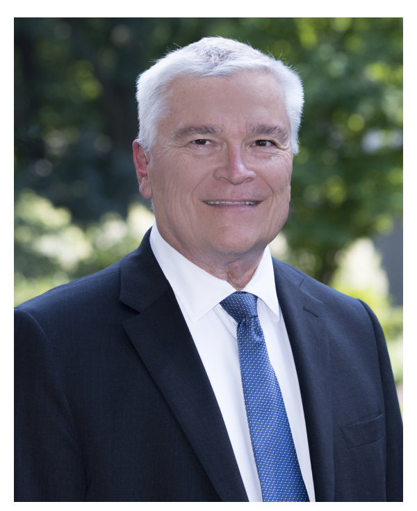
From the President