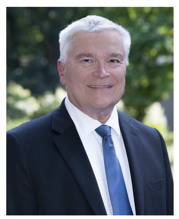
From the President Dear Penn State Community:

Penn State is committed to providing a safe campus environment, and we ask that everyone takes ownership of this goal. Over the years and in myriad ways, Penn State has undertaken many important institutional efforts to address safety issues, including this publication. I urge you to review the information about campus safety measures, reporting crimes and other emergencies, as well as the procedures and policies designed to protect our University community. Penn State's priority is the safety of our students, faculty, staff, and visitors to our campuses, but a truly safe campus can only be achieved through the cooperation of everyone. Thank you for attention to this very important mission.