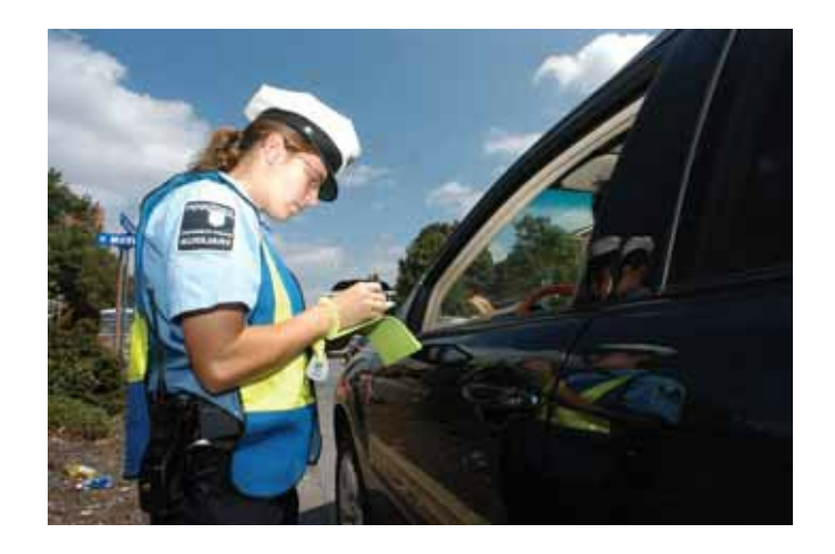
Penn State University Police and Public Safety Department is currently seeking Tier 2 accreditation via the Commission on Accreditation for Law Enforcement Agencies Inc. (CALEA).