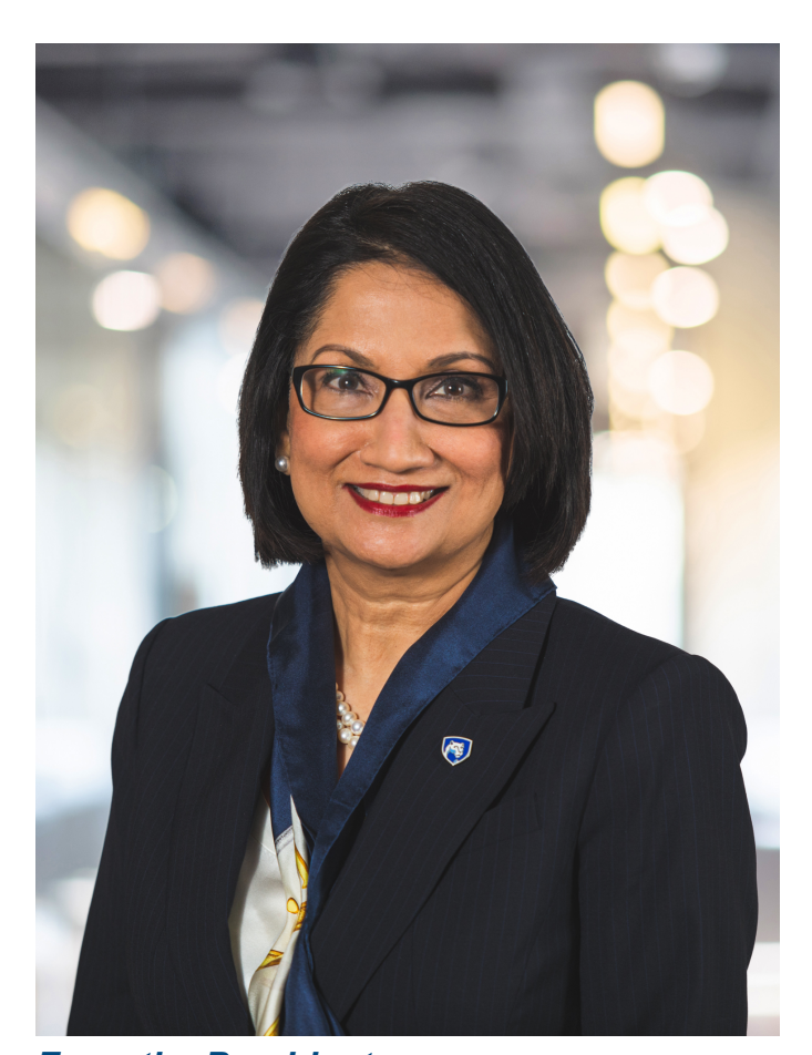
From the President Dear Penn State Community:

Penn State is committed to the safety of our community, the well-being of our community members, and to fostering a secure environment in an open, transparent manner. University Police and Public Safety is a world-class team that has consistently worked to enhance the safety of all campuses, address issues, and respond to the concerns of our community. The release of this Annual Security Report to our University community provides details of our efforts, procedures and policies. I encourage all Penn Staters to review this report, and to play an active role in the shared responsibility of fostering and maintaining a safe environment for every member of our community. The safety of our students, faculty, staff, and visitors is always Penn State's top priority, and we will continue to strive to enhance security at every level across every campus.