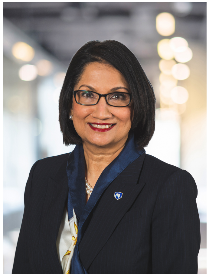
From the President Dear Penn State Community:

Penn State is committed to the safety of our community, the well-being of our community members, and to fostering a secure environment in an open, transparent manner. University Police and Public Safety is a world-class team that has consistently worked to enhance the safety of all campuses, address issues, and respond to the concerns of our community. The release of this Annual Security Report to our University community provides details of our efforts, procedures and policies. I encourage all Penn Staters to review this report, and to play an active role in the shared responsibility of fostering and maintaining a safe environment for every member of our community. The safety of our students, faculty, staff, and visitors is always Penn State's top priority, and we will continue to strive to enhance security at every level across every campus.