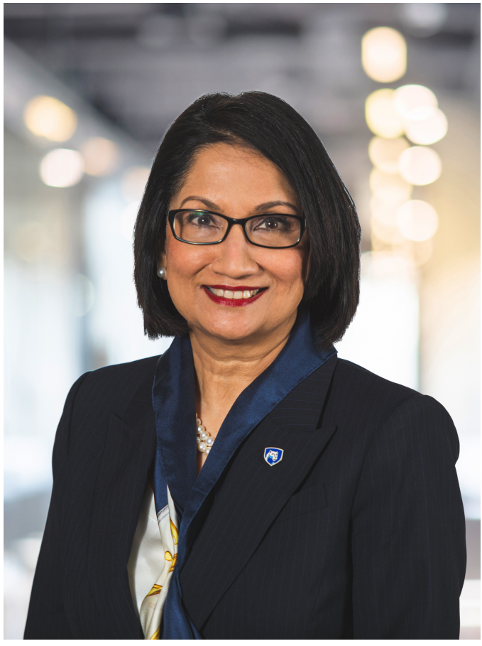
From the President