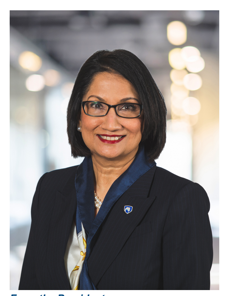
From the President Dear Penn State Community:

Penn State is committed to the safety of our community, the well-being of our community members, and to fostering a secure environment in an open, transparent manner. University Police and Public Safety is a worldclass team that has consistently worked to enhance the safety of all campuses, address issues, and respond to the concerns of our community. The release of this Annual Security Report to our University community provides details of our efforts, procedures and policies. I encourage all Penn Staters to review this report, and to play an active role in the shared responsibility of fostering and maintaining a safe environment for every member of our community. The safety of our students, faculty, staff, and visitors is always Penn State's top priority, and we will continue to strive to enhance security at every level across every campus.