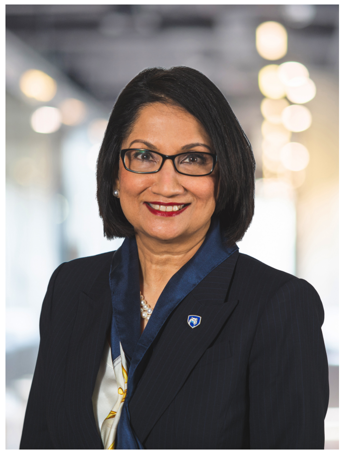
From the President Dear Penn State Community:

Penn State is committed to the safety of our community, the well-being of our community members, and to fostering a secure environment in an open, transparent manner. University Police and Public Safety is a worldclass team that has consistently worked to enhance the safety of all campuses, address issues, and respond to the concerns of our community. The release of this Annual Security Report to our University community provides details of our efforts, procedures and policies. I encourage all Penn Staters to review this report, and to play an active role in the shared responsibility of fostering and maintaining a safe environment for every member of our community. The safety of our students, faculty, staff, and visitors is always Penn State's top priority, and we will continue to strive to enhance security at every level across every campus.