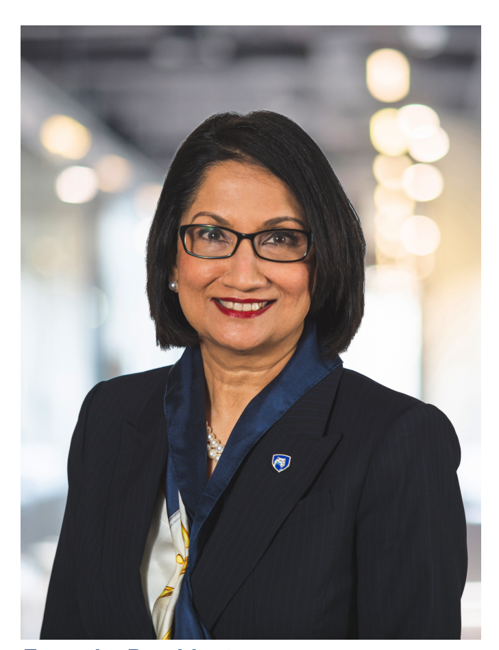
From the President Dear Penn State Community:

Penn State is committed to the safety of our community, the well-being of our community members, and to fostering a secure environment in an open, transparent manner. University Police and Public Safety is a worldclass team that has consistently worked to enhance the safety of all campuses, address issues, and respond to the concerns of our community. The release of this Annual Security Report to our University community provides details of our efforts, procedures and policies. I encourage all Penn Staters to review this report, and to play an active role in the shared responsibility of fostering and maintaining a safe environment for every member of our community. The safety of our students, faculty, staff, and visitors is always Penn State's top priority, and we will continue to strive to enhance security at every level across every campus.