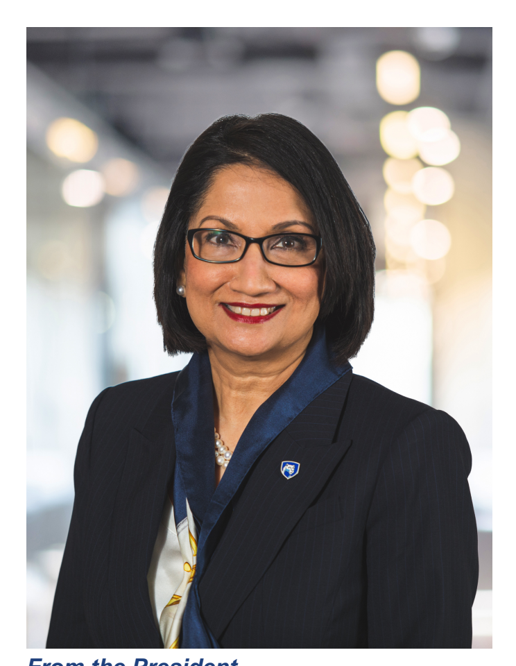
From the President Dear Penn State Community:

Penn State is committed to the safety of our community. the well-being of our community members, and to fostering a secure environment in an open, transparent manner. University Police and Public Safety is a worldclass team that has consistently worked to enhance the safety of all campuses, address issues, and respond to the concerns of our community. The release of this Annual Security Report to our University community provides details of our efforts, procedures and policies. I encourage all Penn Staters to review this report, and to play an active role in the shared responsibility of fostering and maintaining a safe environment for every member of our community. The safety of our students, faculty, staff, and visitors is always Penn State's top priority, and we will continue to strive to enhance security at every level across every campus.