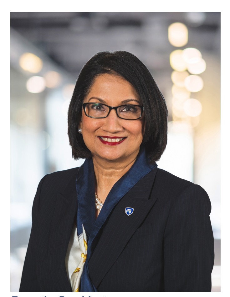
From the President Dear Penn State Community:

Penn State is committed to the safety of our community, the well-being of our community members, and to fostering a secure environment in an open, transparent manner. University Police and Public Safety is a worldclass team that has consistently worked to enhance the safety of all campuses, address issues, and respond to the concerns of our community. The release of this Annual Security Report to our University community provides details of our efforts, procedures and policies. I encourage all Penn Staters to review this report, and to play an active role in the shared responsibility of fostering and maintaining a safe environment for every member of our community. The safety of our students, faculty, staff, and visitors is always Penn State's top priority, and we will continue to strive to enhance security at every level across every campus.